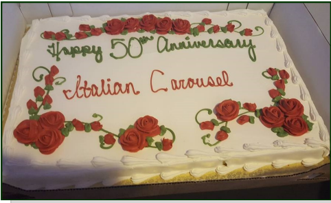
Joe Capogreco - Celebrating 50 years on the radio