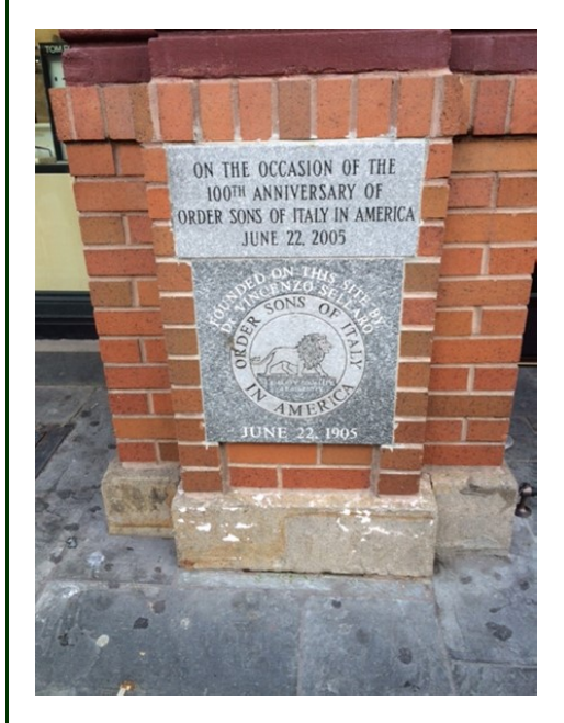
Outside the museum on Grand Street.