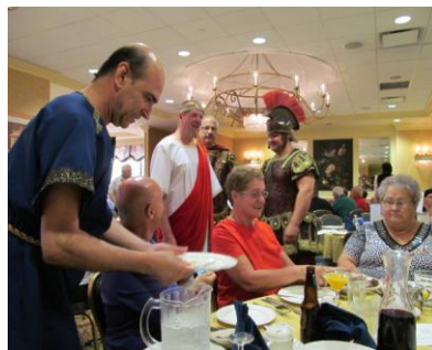
Friday Night was Roman Dinner Night in the Main Dining Room