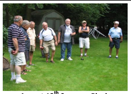
August 13<sup>th</sup> Summer Picnic

Thank you all for your generosity and help with this campaign. As you can see, little things mean a lot when you don't have much.