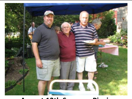
August 13th Summer Picnic