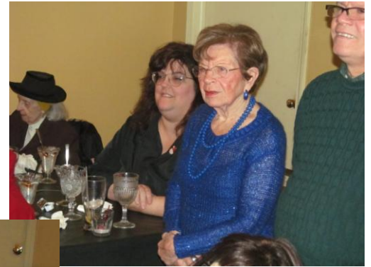
Gigi's Restaurant Sunday December 2, 2012